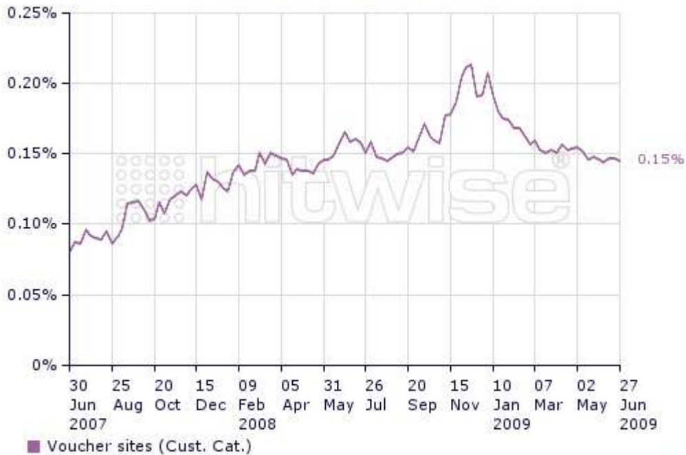
UK Internet visits to voucher websites

Weekly market share in 'All Categories', measured by visits, based on UK usage.